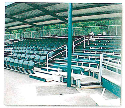
McLennan Community College - Waco, TX