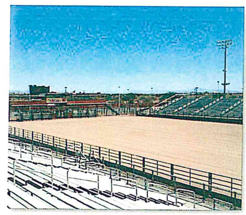
Wild Horse Pass Arena - Chandler, AZ