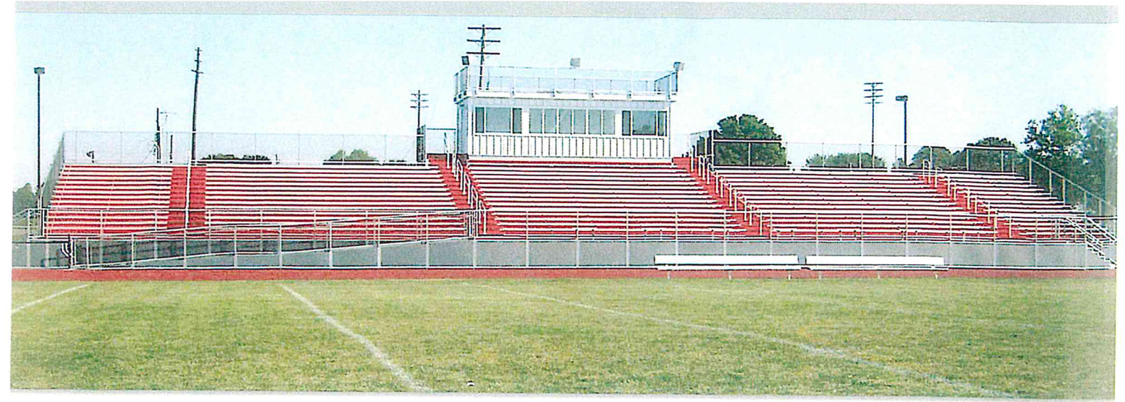
New Lebanon High School - Lebanon, OH