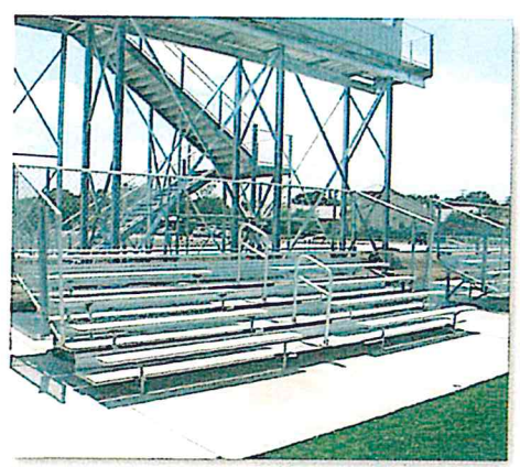
Schertz-Cibolo ISD - Cibolo, TX